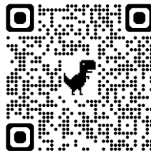
St. John's Facebook