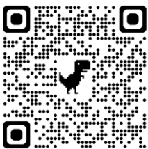
St. John's Website

We are moving into the digital age for your convenience! The following QR codes can help you navigate to the St. John's website, St. John's Facebook page and share your offerings through tithely. Just scan the QR code and it will take you to that site.