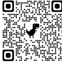
St. John's Facebook