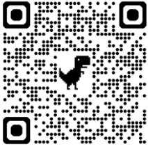
St. John's Website

The following QR codes can help you navigate to the St. John's website, St. John's Facebook page and share your offerings through tithely. Just scan the QR code and it will take you to that site.