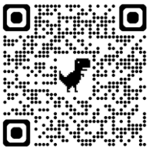
St. John's Website

The following QR codes can help you navigate to the St. John's website, St. John's Facebook page and share your offerings through tithely. Just scan the QR code and it will take you to that site.