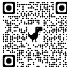
St. John's Facebook